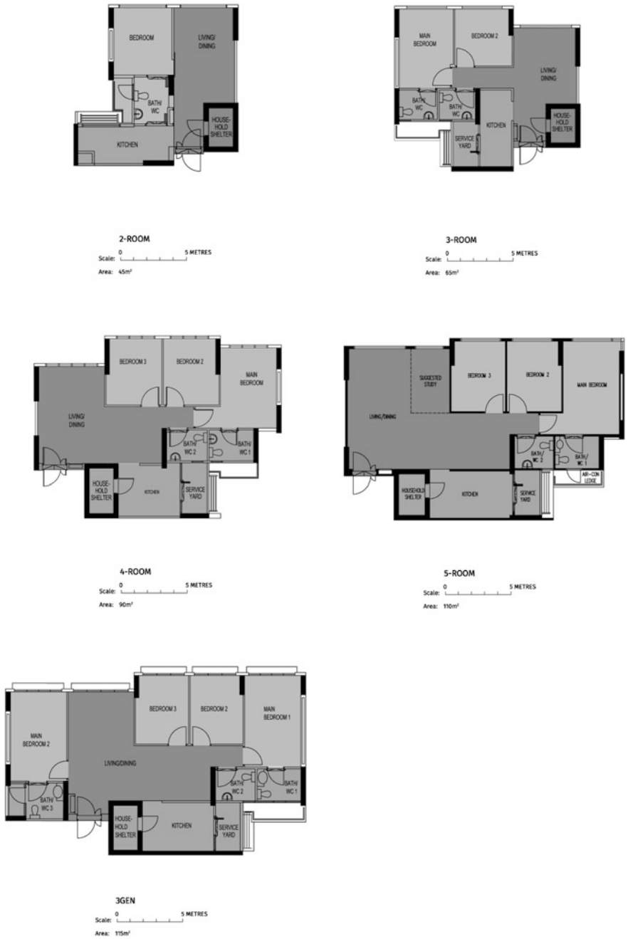
Fig. 1.1 HDB floor plans of various flat typologies.